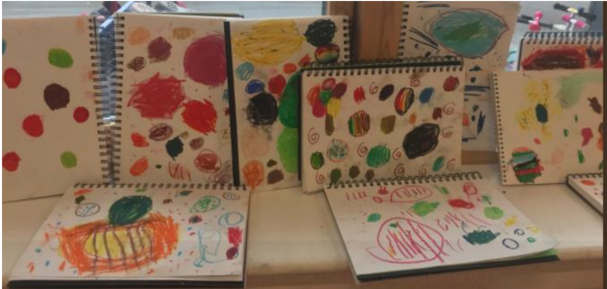
Every child at Wallscourt Farm Academy owns their own sketchbook. This is an example of colour mixing in Year 1.