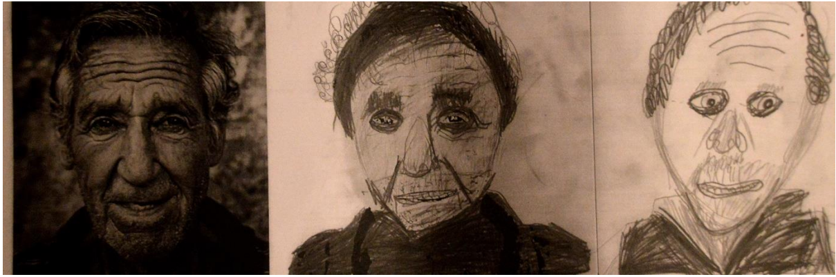
Drawing from observation in Year 1,