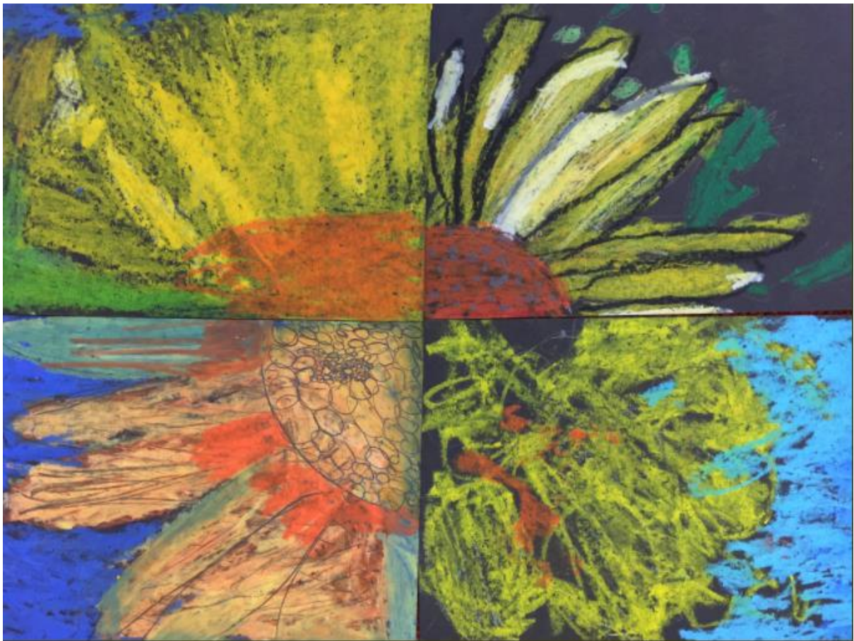
Learning collaboratively as artists. Exploring oil pastels.