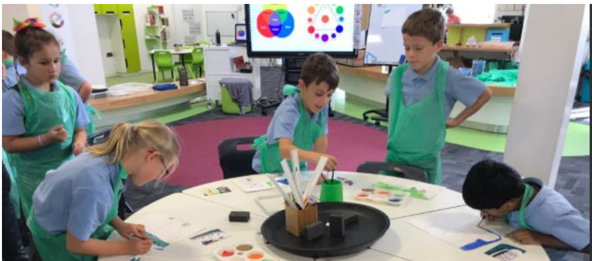
Colour mixing in Year 3